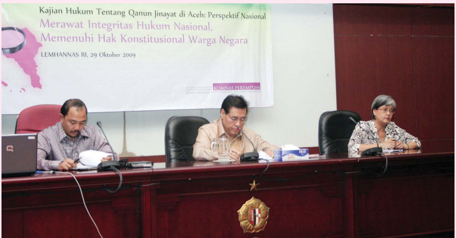
Lemhannas RI Governor Prof.DR. Muladi, SH opened Program of Study of Law about Qanun Jinayah in Lemhannas RI accompanied by the organizer committee from KOMNAS Perempuan on October 29, 2009.

Feminism movement is a universal movement since 1990 based on the empirical experience of the women who always become the victim of discriminative act as "global issue". Qanun Jinayah together with law procedure of qanun is based on the Islamic law in Nangroe Aceh Darussalam. In its discussion, there are many controversies. For those opposing, they demand Qanun should be revised since it contains several sanctions (physical punishment), while such draft is not yet socialized to the community and only touches the lower class group as well as there is impression that the draft was made hastily by DPRD, while Qanun Jinayah is not the answer for Aceh's community need for moral and social problem potentially generating new conflict and not securing the legal assurance (multi interpretation), as well as directing to criminalization of not guilty person especially female. While for those supporting Qanun, state that: the community unnecessarily denies Qanun Jinayah, if there is no intention to commit adultery, why so worried. The effectiveness of this Islamic law generates controversy in the national level marked by disagreement between those pro and contra. It must be admitted that finally it will relate the Constitution of 1945 confirming Pancasila as state foundation in the preamble and provisions on Human Rights(HAM) provided for after amendment.