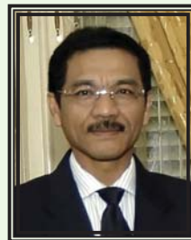
Gamawan Fauzi Alumni KSKA I Lemhannas RI as Minister of Home Affairs of the Republic of Indonesia