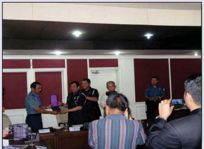
Exchange of souvenirs between the delegation of Lemhannas RI and Hon Ronaldo V. Puno, (Secretary of DILG) and Gen Jesus A. Verzosa (Police Chief Director)