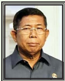
Lieutenant General TNI (Ret) Sudi Silalahi Alumni KSA IX Lemhannas RI as Minister of State Secretary