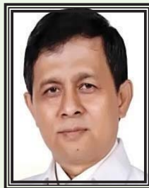
Drs. Suharna Surapranata Alumni KSA X Lemhannas RI as Minister of Research and Technology of the Republic of Indonesia