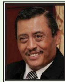
General Pol (Ret) Sutanto Alumni KSA X Lemhannas RI as State Intelligent Board of the Republic of Indonesia