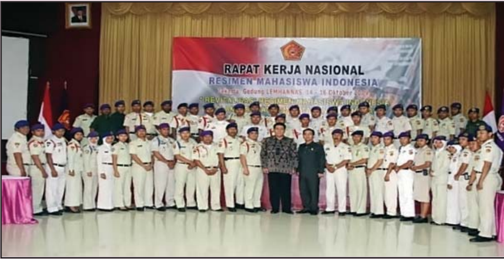
Lemhannas RI Governor Prof.DR. Muladi, SH posed with the Indonesian Students Regiment for picture taking in Rakernas program on October 14, 2009 at Dwi Warna Purwa Building Lemhannas RI

Lemhannas RI Governor Prof. DR. Muladi, SH, when opening the National Meeting of the Student Regiment activity stated the vision of the national development for period of 2000-2005 according to the Law No. 17 of 2007, describing the Indonesian condition in the future as “an independent, modern, just and prosperous Indonesia”, in the Unitary State of the Republic of Indonesia (NKRI) based on Pancasila and Constitution of 1945, therefore it should be supported by: