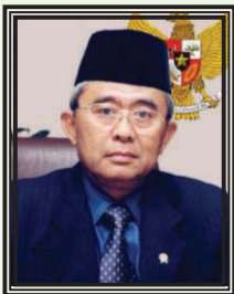
Ir. Djoko Kirmanto, Dipl. HE Alumni KRA XXVI Lemhannas RI as Minister of Public Works of the Republic of Indonesia