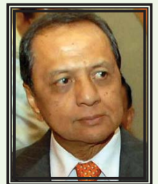
M.S. Hidayat Directing Board as Minister of Industry Affairs of the Republic of Indonesia