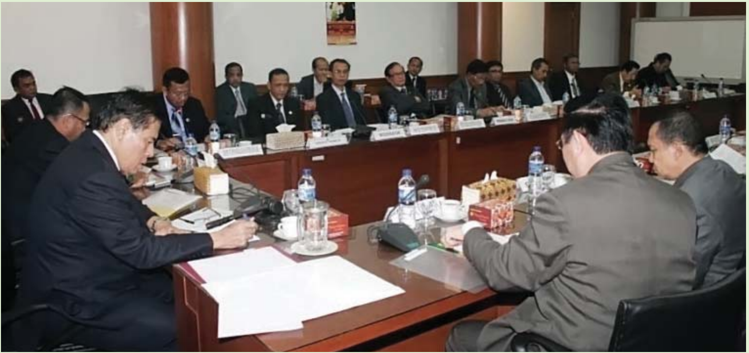
Roundtable Discussion on Social and Culture with theme "Actualization of Checks and Balances Among Executive, Legislative and Judicial Institutions Post General Election of 2009 to Support the Success of Strategic Policy on National Development 2010-2014" was opened by Lemhannas RI Governor dated October 27, 2009 in the Meeting Room Nusantara I Lemhannas RI