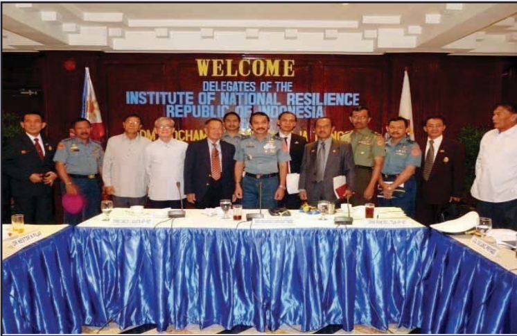
Chairman of Group and Representative of SSLN's participants posed with several staffs of one of the Philippine Government agencies for picture taking after the visit activity program finished

98 participants of the Regular Education Program (PPRA) Batch XLIII year 2009 including 4 (four) participants from the fellow countries namely from Australia, Malaysia, Thailand and Singapore before the end of their training conducted one of main activities namely Overseas Strategic Study (SSLN) to Australia, China, the Philippine, Vietnam and Brunei Darussalam on October 11 to 16, 2009.