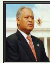
Prof. Dr. Ir. Purnomo Yugiantoro, MSc Alumni KRA XXVI Lemhannas RI as Minister of Defense of the Republic of Indonesia