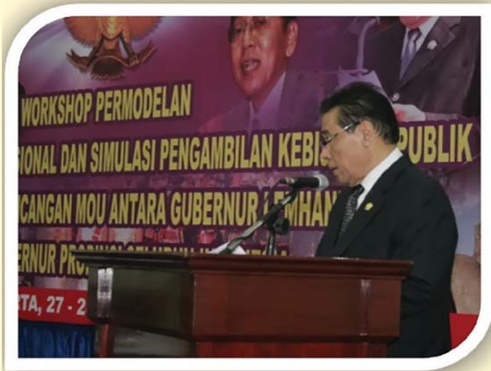
Governor of Lemhannas addressed remarks in the opening program of Workshop on National Resilience System Modeling and Public Policy Simulation

W orkshop on Modeling of National Resilience System and Simulation on the Public Policy in Dwi Warna Purwa Building Lemhannas RI on October 27, 2009 was opened by Lemhannas RI Governor Prof. DR. Muladi, SH and attended by the Heads of Provincial Development Planning Agency at district/province level (Bappeda), Head of Provincial Central Bureau of Statistics and representatives of Universities from 33 Provinces throughout Indonesia.