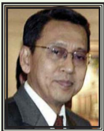
Prof. DR. Boediono Lemhannas RI Directing Board as Vice President of the Republic of Indonesia

Lemhannas RI Governor and all Big Families of Lemhannas RI felt glad and addressed congratulation to two members of Governing Board as well 12 alumnus of Lemhannas RI for the trust of the President of the Republic Indonesia who has appointed them as the Vice-President, Minister and Vice-Minister in Indonesia Bersatu Cabinet II for Period of 2009-2014.