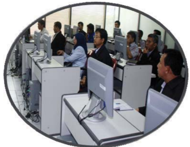
The participants of E-Procurement Training are looking at the description in the Telematic Computer Laboratory of Lemhannas RI

As demand for fast ICT development in many life and work aspects, so the community is able to see the list of goods and service procurement wholly and clearly. This E-Procurement for the goods and service procurement can be made on online basis via internet and integrated to the assets management.