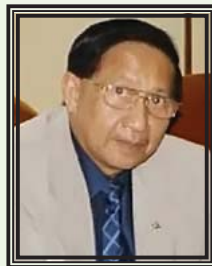
Lieutenant General TNI (Ret) E.E. Mangindaan Alumni KRA XXIII Lemhannas RI as Minister of State Reform & Bureaucracy Reform of the Republic of Indonesia