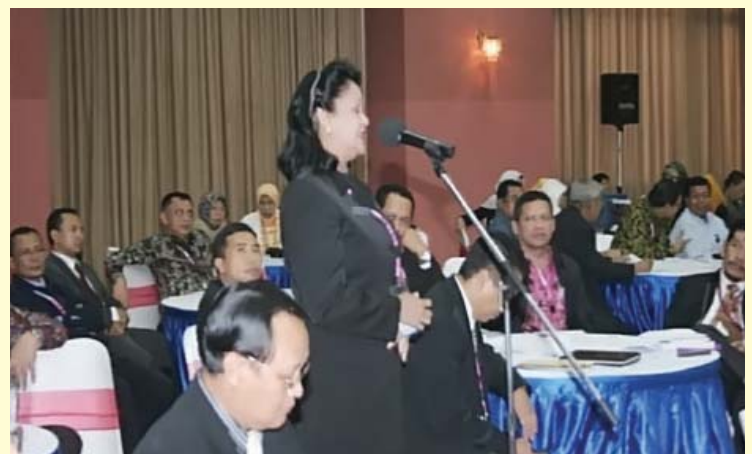
One of Workshop's participants asked a question and gave suggestion

There are several matters that must be examined and reviewed, whether about the dimension, variable, indicator, parameter even instrument already developed by Lemhannas RI.