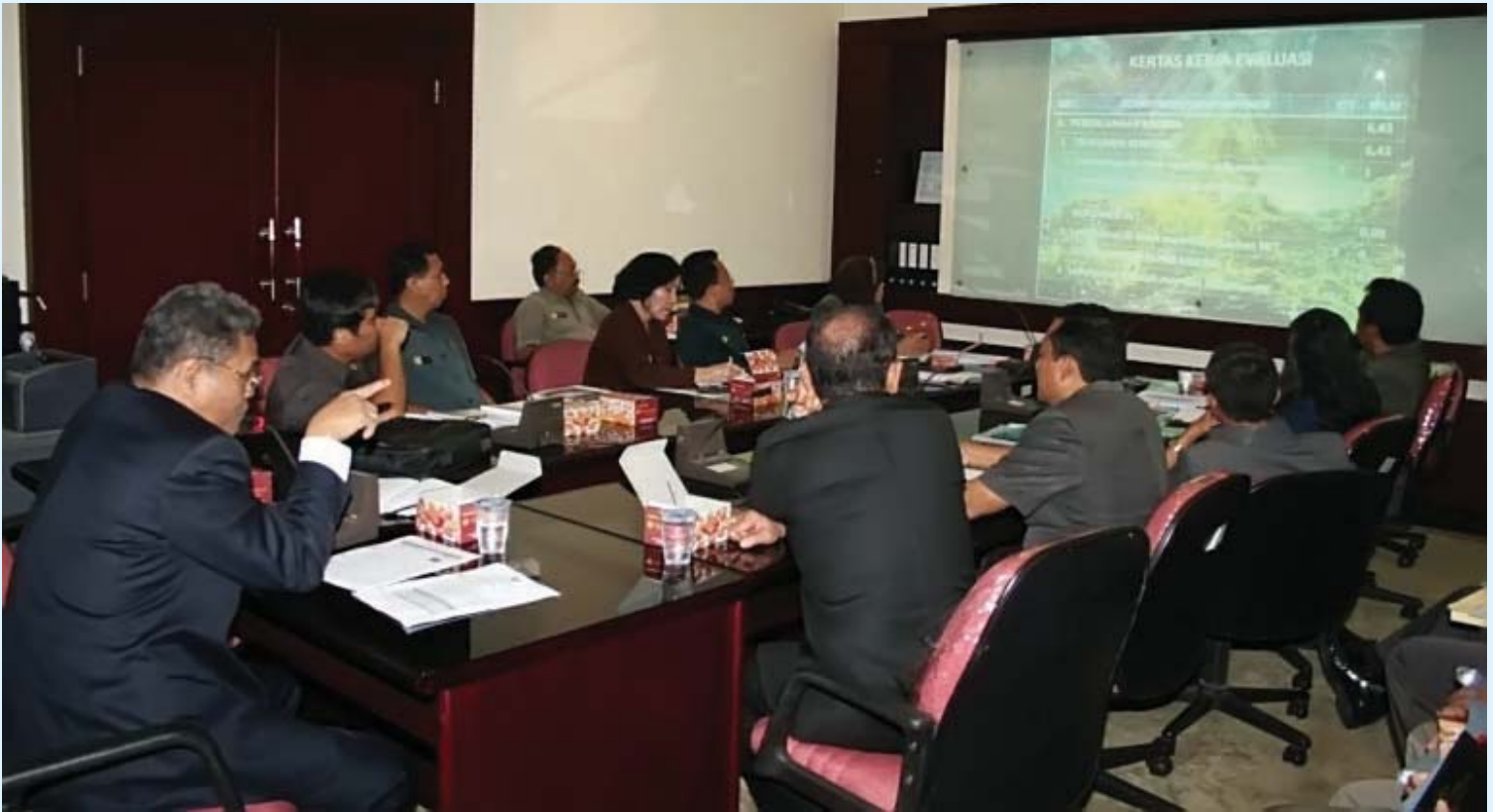
Brigadier General Police Drs. Alpiner Sinaga was chairing the Early Discussion Meeting of Revision to Lemhannas RI Performance Indicator of 2008 on October 20, 2009 in the Nusantara Meeting Room II Lemhannas RI

For the implementation of the clean and authorized governance, the Inspectorate of Lemhannas RI makes revision to LAKIP Of 2008 and preparation of LAKIP 2009. The program was opened by the Brigadier General Police Drs. Alpiner Sinaga and continued with the description on result of Evaluation to the State Ministers of State Reform for the Accountability of Lemhanas RI Performance of 2007. Five components assessed in the evaluation the State Minister of State Reform for Lemhanas performance accountability are, First, Performance planning, Second, Performance Measurement, Third, Performance Reporting, Fourth, Performance Evaluation, Fifth, Performance attainment. The revision to LAKIP 2008 and preparation of LAKIP 2009 Lemhanas RI has a Strategic Plan covering: objective, target (description and indicator), policy and program. The materialization of obligation of a government agency to account for the success/failure of implementation of organization's mission in attaining the objectives and targets already stipulated, through an accountability media periodically. LAKIP has four systems: first Performance planning, second Performance measurement, third Performance reporting, fourth Evaluation and utilization of information on performance.