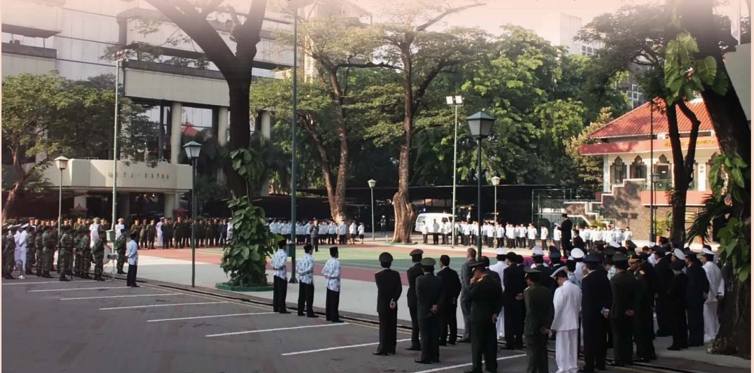
Lemhanas RI Governor Prof.DR. Muladi, SH Read Out the mandate for the 81st Youth Pledge Day on October 28, 2009.

The democratization triggers the growth of spirit to convey aspiration, and press freedom has made effective social control, and law and Human Rights (HAM) are continuously enforced. On the other hand, the reform is misinterpreted by part of community's groups thereby disturbing the national development running. In this respect, the commemoration of Youth Pledge of 2009, is among others intended to answer many weaknesses of development constituting the responsibility of all Indonesian people without exception including Lemhannas RI to increase the performance according to their respective main task and function optimally.