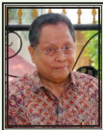
Dr. Ir. Mustafa Abubakar Alumni KSA X Lemhannas RI as State Minister for State Owned Company of the Republic of Indonesia