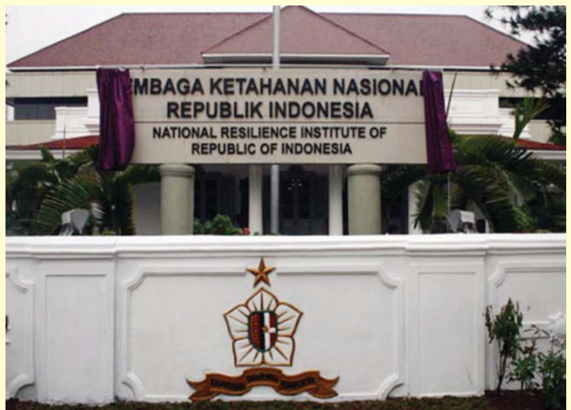
Opening of new Lemhannas RI Name Board cover