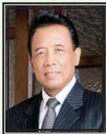
Marshall TNI (Ret) Djoko Suyanto Alumni KRA XXXII Lemhannas RI as Coordinator Minister for Politic Law Security